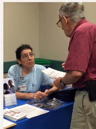
Below: Presentation during the 2017 Caregiver's Summit.